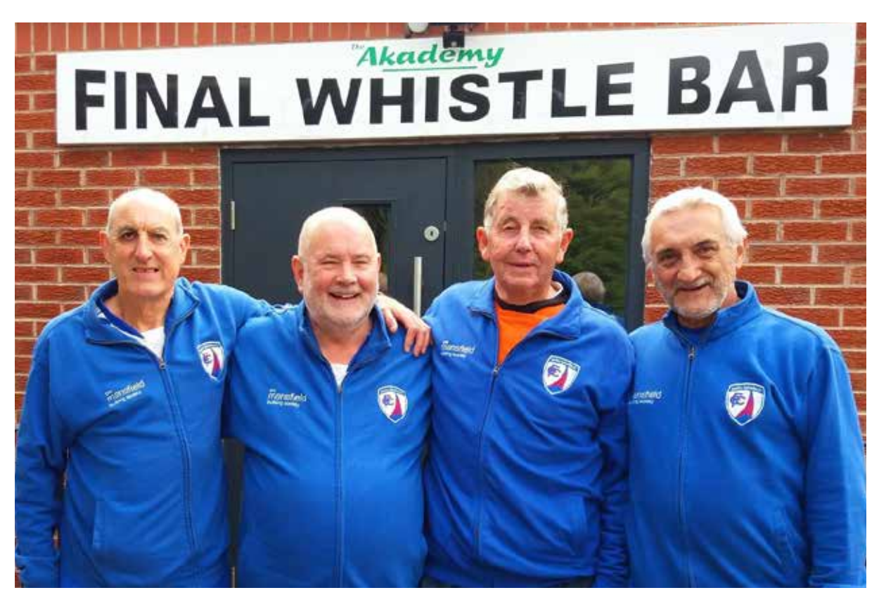
The 1st ever Walking Football team - The Senior Spireites from Chesterfield.